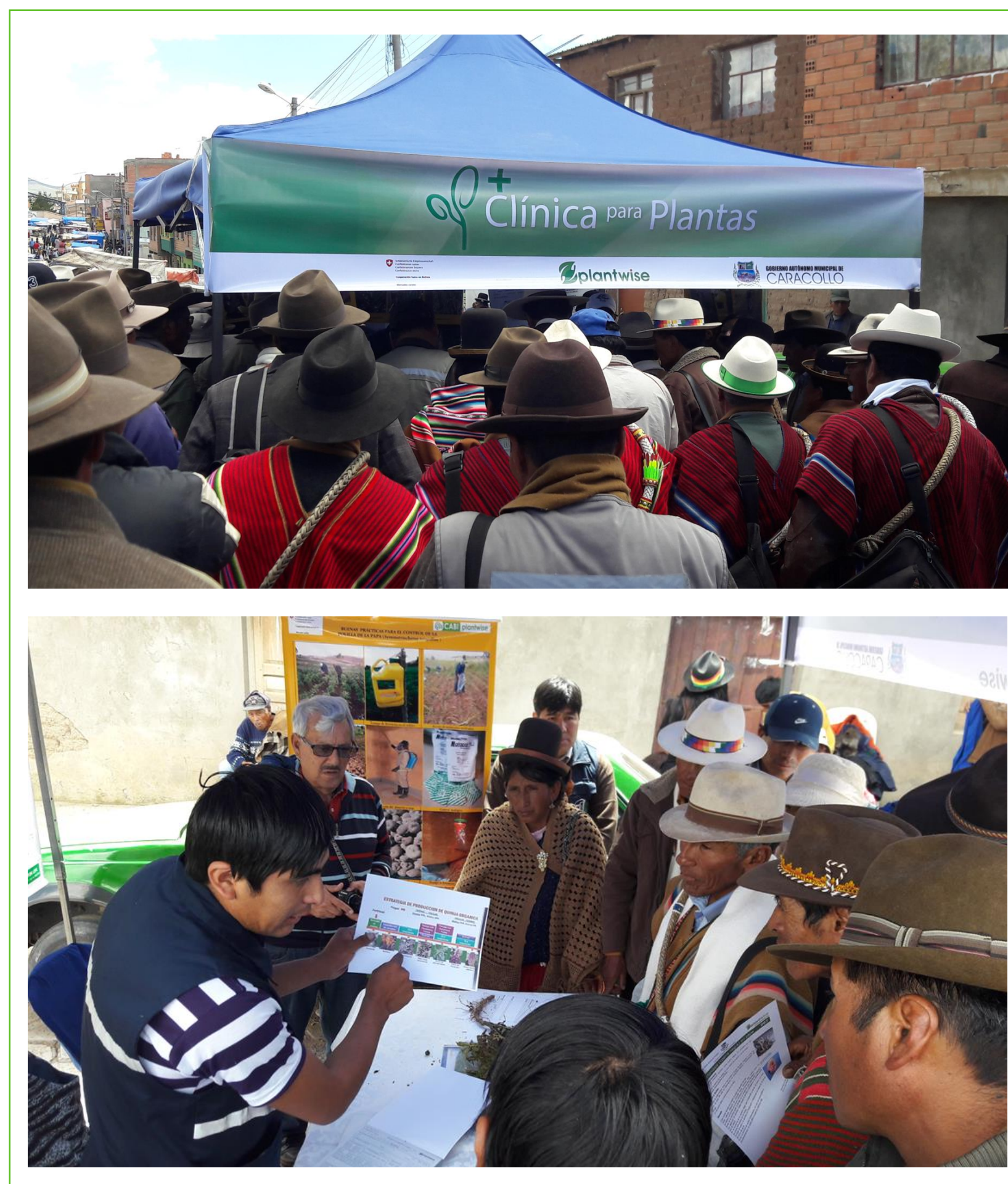
Figure 1, 2: Farmers attending Plant Clinic in Caracollo, Bolivia, bringing samples and getting the recommendation for control of the key problems