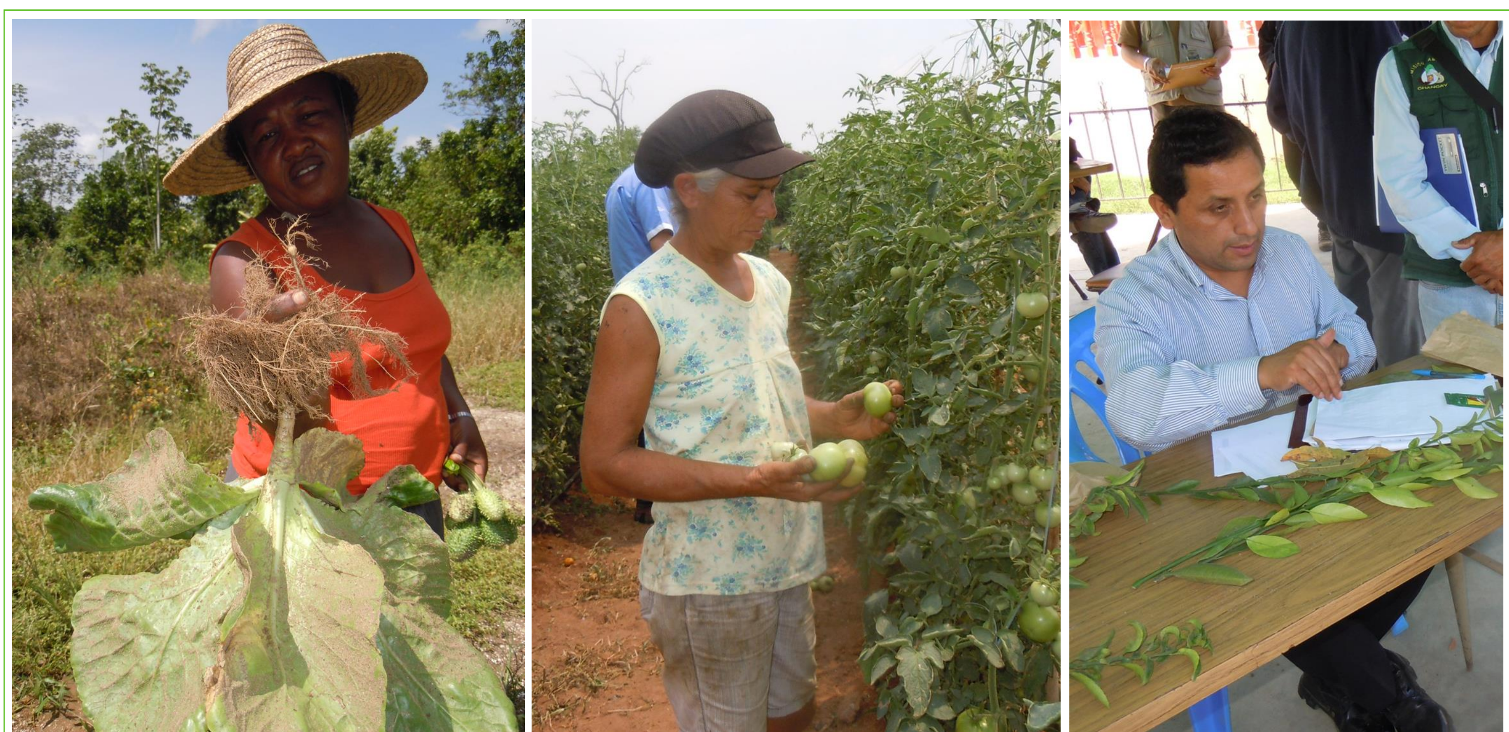
Figure 7, 8, 9: The programme is helping farmers to control the problems they are facing at the field level applying sustainable methods of control

Acknowledgements: We wish to acknowledge the support of our donors, as well as our national and international partners who make Plantwise possible