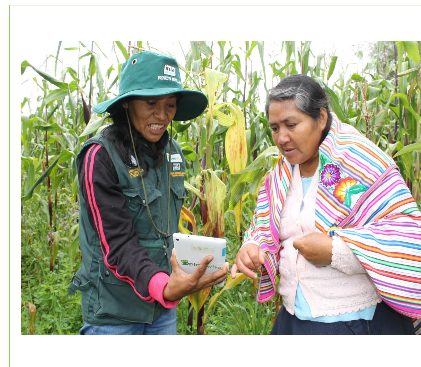
Figure 6: e-plant clinics helping to improve the service using ICT tools