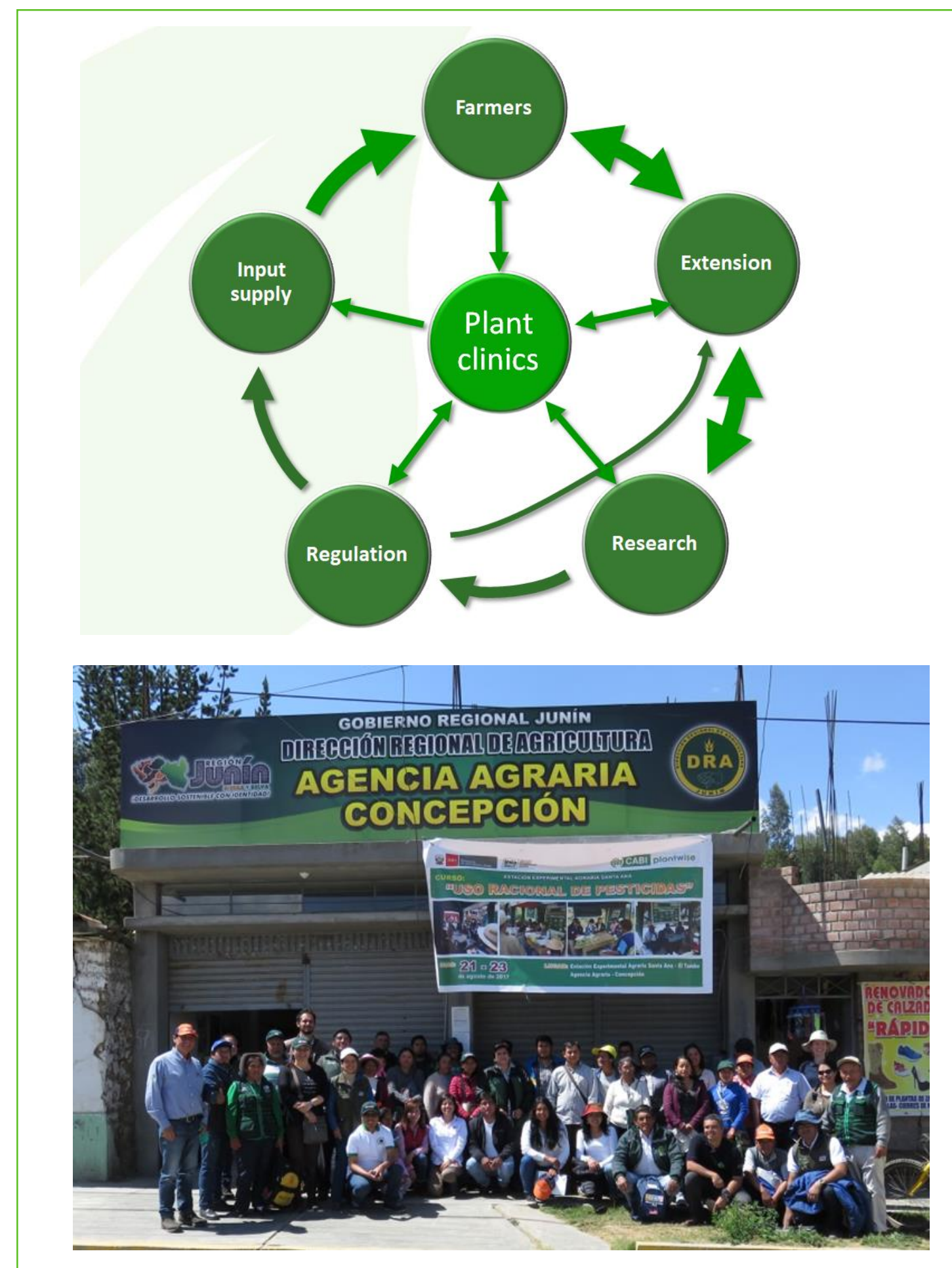
Figure 3, 4: Collaboration within national plant health systems enables these actors to be more effective in their work to improve plant health, with concrete benefits for farmers